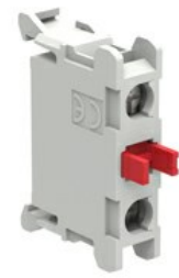
Contact elements, base mount on LPZ control station LPXCB